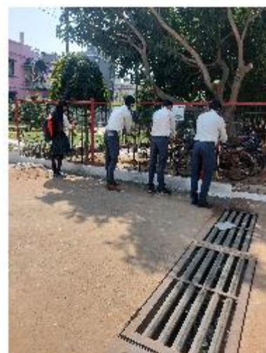
Wash Basin System