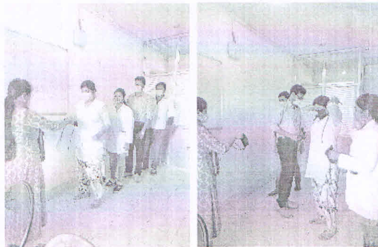
Distribution of Masks