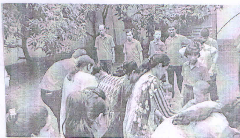
Rakshabandhan with the differently abled children of HOPE School, Durgapur

On 3 rd August, students of first year B. Pharm. of Dr. B. C. Roy College of Pharmacy and AHS has visited the "Missionaries of Charity" and celebrated "Rakshabandhan" with the differently abled children of HOPE School, Durgapur followed by distributing sweets and gifts to them.