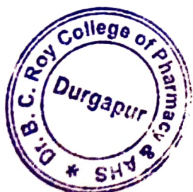
Dr. B. C. Roy College of Pharmacy & AHS Durgapur, West Bengal-713206 Principal