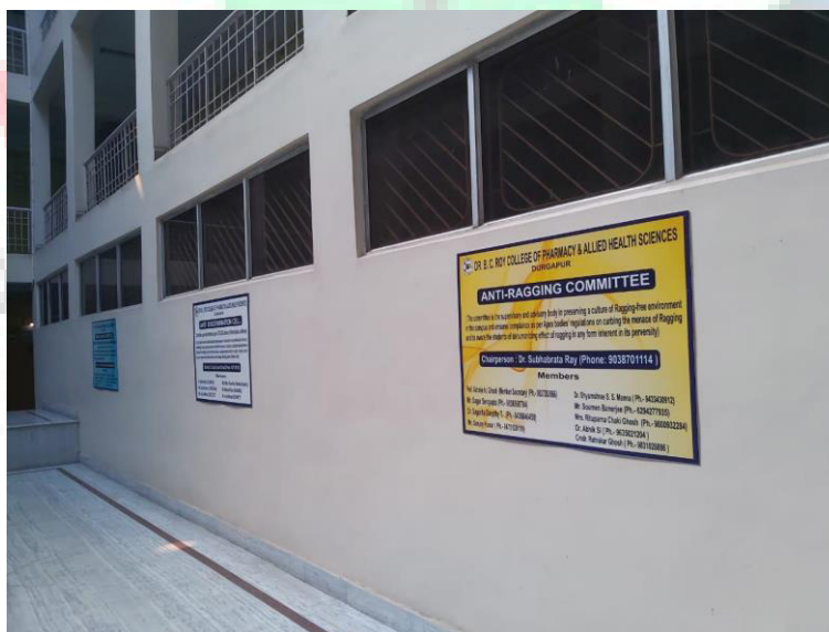
AWARENESS THROUGH DISPLAYS/POSTERS